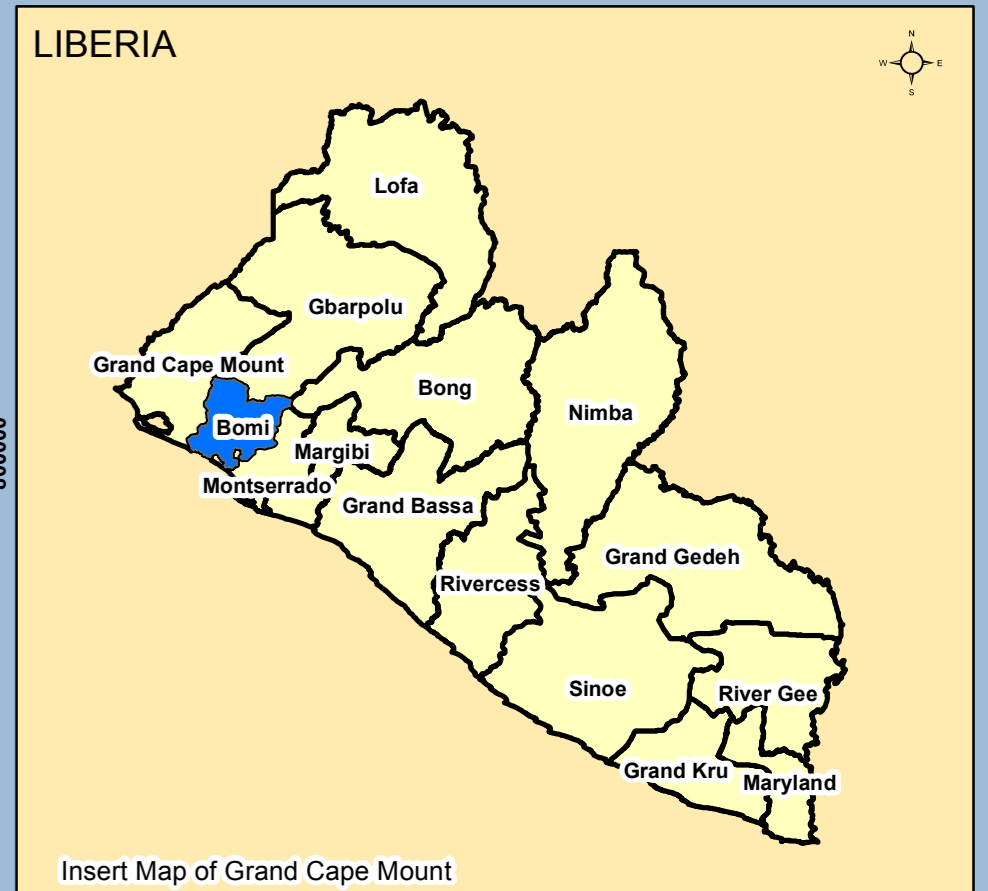
Insert Map of Grand Cape Mount